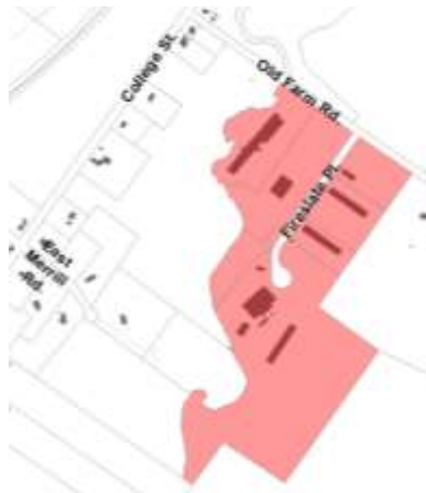
Fireslate Place OS Area