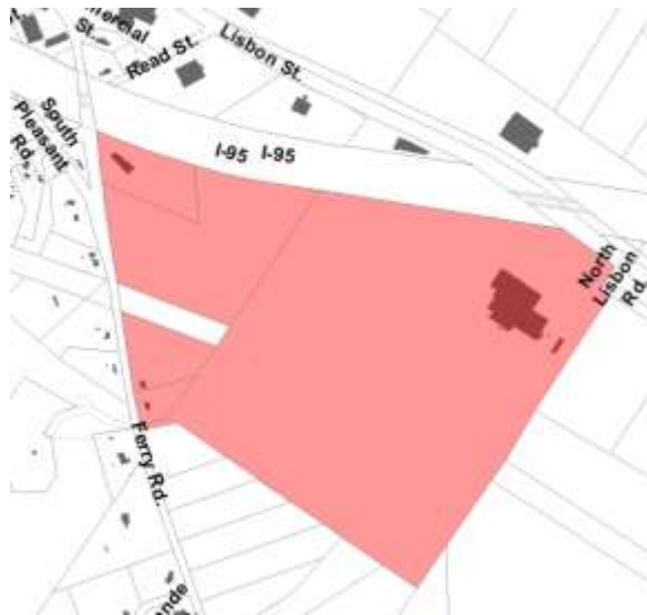
Lisbon Street OS Area