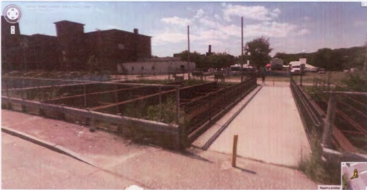
Figure 2 – Simard-Payne Pedestrian Bridge, Street View Looking South

The services provided by HNTB will consist primarily of the following: