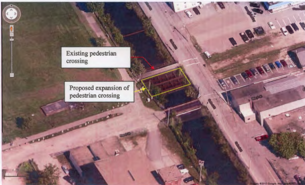
Figure 1 – Simard-Payne Pedestrian Bridge, Aerial View

HNTB proposes to provide professional structural engineering services to the City of Lewiston for an evaluation of the structural adequacy of two abandoned railroad bridges to support the widening of an existing pedestrian crossing over the Lower Canal (see Figures 1 and 2). HNTB will assess the condition and structural capacity of the existing steel framing components, located south of the existing crossing, and provide a recommendation to the City regarding the safe load capacity of the existing framing components, their suitability for reuse, and general recommendations for development of the proposed bridge modifications. Based on previous discussions with the City, as-built drawings for the existing structures are not expected to be available.